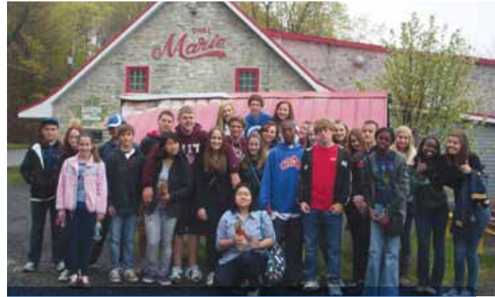
The 8th Grade visits Chez Marie, a traditional stop on the Québec trip.