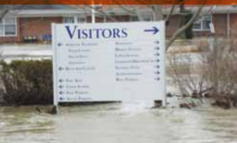
Water covered the bridge preventing any and all vehicles from crossing.