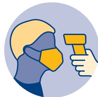
TEMPERATURE CHECK ON ARRIVAL

Screening will take place in front of the entrance door if weather allows or just inside the doors. A faculty or staff member will check the student's temperature and ask for verbal confirmation regarding the absence of COVID-19 symptoms. Presence of any of the following COVID-19 related symptoms will result in the student being sent home.