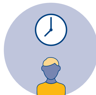
LIMITED VISITORS BY APPOINTMENT