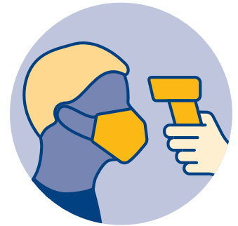
TEMPERATURE CHECK ON ARRIVAL

Screening will take place in front of the entrance door if weather allows or just inside the doors. A faculty or staff member will check the student's temperature and ask for verbal confirmation regarding the absence of COVID-19 symptoms. Presence of any of the following COVID-19 related symptoms will result in the student being sent home.