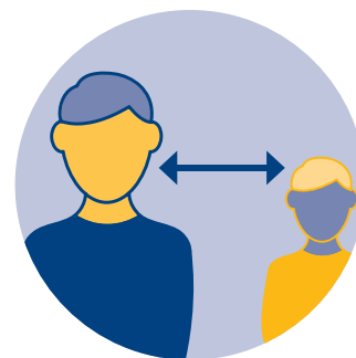
6' SOCIAL DISTANCE