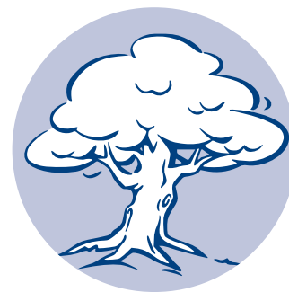
OUTDOOR LEARNING ENCOURAGED