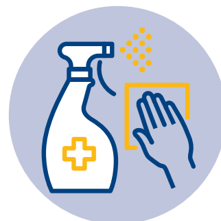
SANITIZATION DURING AND AFTER SCHOOL