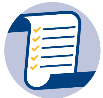
COVID-19 SYMPTOM CHECK